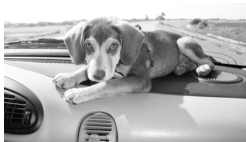
Phin looking sad from too much time in the car. We felt the same way! Four straight 10-12 hour days.

Here is a picture tour of our journey to Mexico. (More will be on the web once we have some time to think down here!!!)