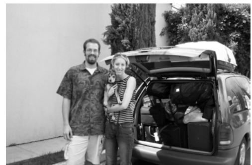
Finally arriving loaded down in Puebla. This is in front of the Morgan's house where we are staying.