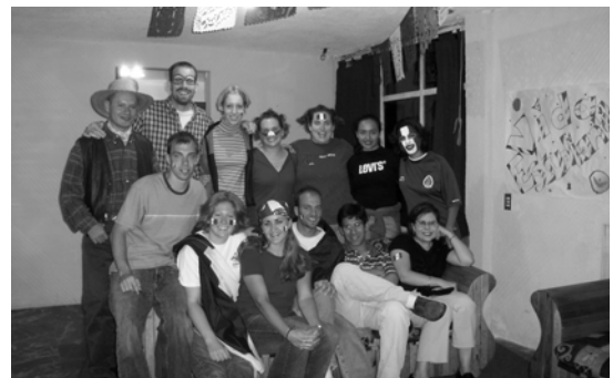
On Sep. 15th we celebrated Mexico's independence with the team from BUAP.. Check out our website for more photos!!!