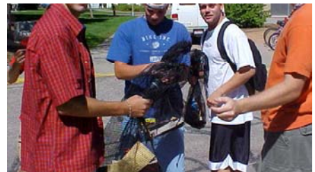
Handing out 3 of the 880 kits distributed that day

As it says in Luke 8, the seed is the Word of God, and we are trying to spread it all over this campus!