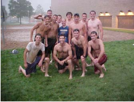
Together Turning Lost Students into Christ Centered Laborers!

The final game of the volleyball party went great, even with the rain!