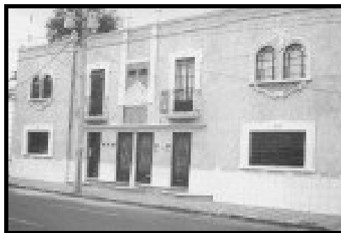
The Spanish Institute of Puebla